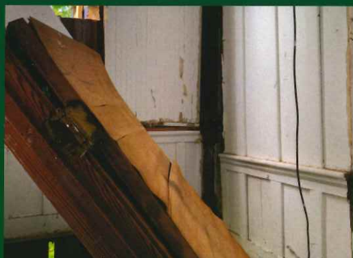
The restroom door and half of the wall was detached during the storm and crashed into a window facing the porch.